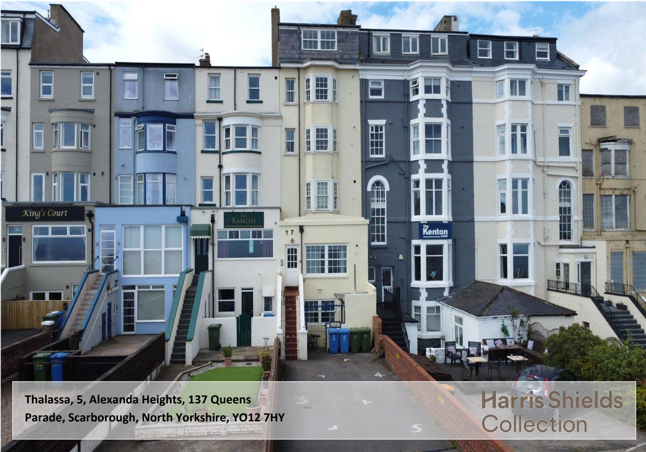
Thalassa, 5, Alexandra Heights, 137 Queens Parade, Scarborough, North Yorkshire, YO12 7HY